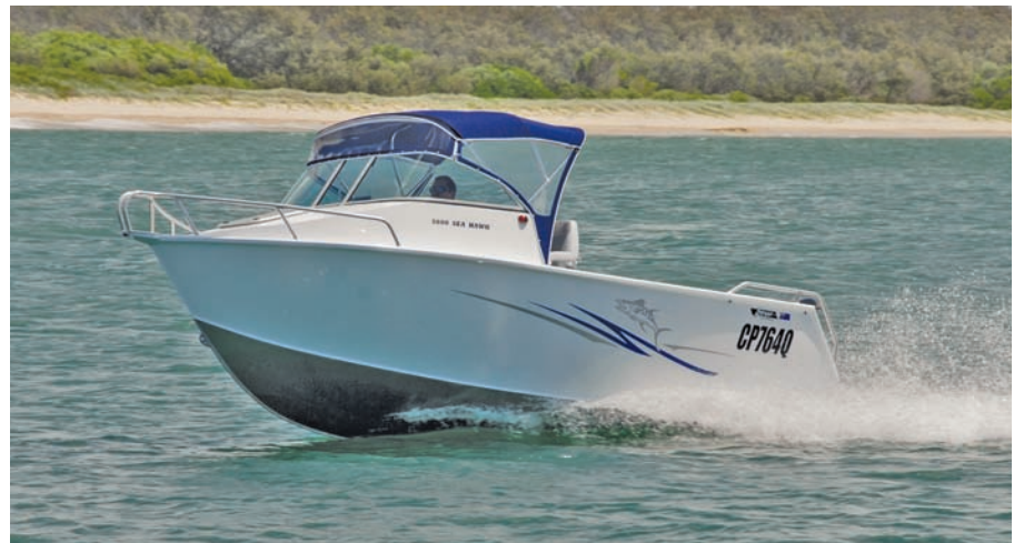
That big Seahawk is an impressive sight under way.

On the Seahawk's dash there is ample room for navigational aids. No matter how large the sounder or GPS unit is, it will easily tuck in behind the windscreen and be in full view of the skipper sitting high and clear of obstruction. This was exactly the case with the test craft's Northstar 657 Sounder GPS mounted starboard of the instruments.