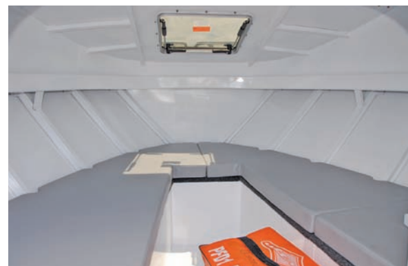
The Seahawk's cabin will sleep two in standard form, more with a bunk infill.