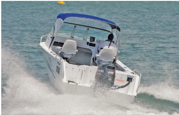
Scooting out of a turn to starboard the Seahawk shows off high sides.

The new Stessl Seahawk is very impressive. It's high, wide, and mighty handsome and combines plenty of on-board fishing features with enough sea keeping ability to see them put to good use.