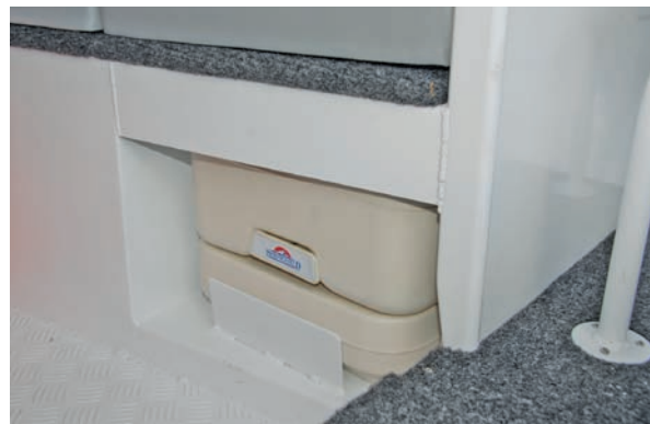
A marine toilet is a cabin feature of the rig.

is very handy in a craft venturing offshore. I think there can never be too many grab handles around when seas turn nasty.