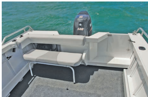
The Seahawk's wide transom area features a removable three person seat.

The big Stessl handled sloppy water very well with no inclination to bang or bash whether heading into chop or quartering away from it. Low speed driving was easy with seas astern as the hull responded to driver input very readily.