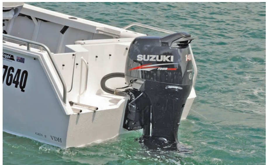
The 140 Suzuki was a top power plant for the Seahawk.

The Seahawk's high sides offer plenty of protection from the sea but would not, in my opinion, affect fish-ability. A really big fish could be brought in via the transom door if necessary.