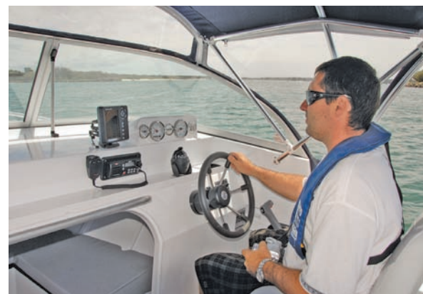
A very practical dash layout is a feature of all these late model Stessls.

To find your nearest dealer to arrange a test run, jump on the web at www.stessl.com.au .